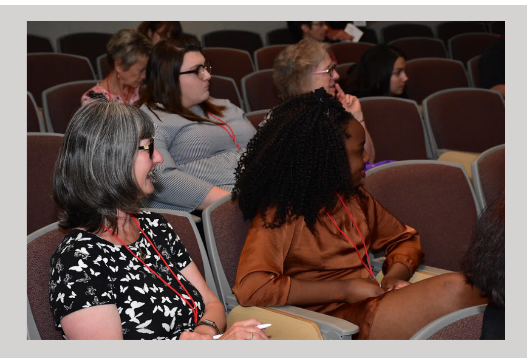
Conference attendees listen intently to a presentation.

Many conference participants responded to the evaluation survey, with more than 90% of the respondents noting that the conference provided them with new strategies for promoting global learning. "To present my research" was noted as the major reason for attending the conference. Respondents expressed support for both online and face-to-face conferences, noting the value of face-to-face gatherings for networking with other international educators. Survey results also contained good suggestions for future conferences to be considered by the Board as, for example, to provide more ideas to local chapters and to involve more students.